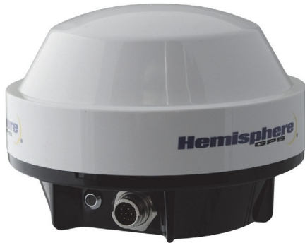
Figure 1-1: A325 smart antenna

Note: Throughout the rest of this manual, the A325 Smart Antenna is referred to simply as the A325.